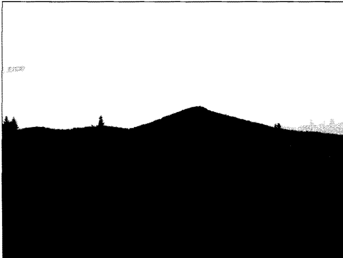
Figure 2. A picture of the Cavan site taken in August 2015. The former Lawson House is at the present time obscured by a cluster of Norway Spruce trees and the "grove of sugar trees" has vanished. Gose Knob is in the distance in the background.

of standing trees has changed, but otherwise the view is remarkably similar to the earlier one. A close-up view of the cabin site is shown in figure 3.